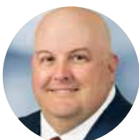
Davis Wright Robinson & Cole